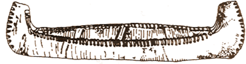
Algonquian birchbark canoe (Great Lakes)

Name: _____ Date: _____ Class: _____ Instructor: _____