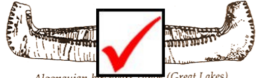
Algonquian birchbark canoe (Great Lakes)

Name: _____ Date: _____ Class: _____ Instructor: _____