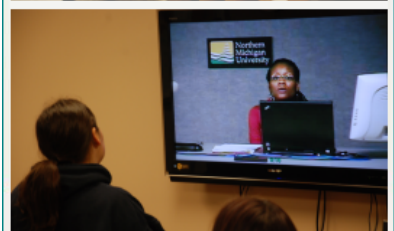
Language Instructional Skills Training with NMU Education Professors via ITV real-time video conferencing

Project Ewikkendaswat Ekenomagewat funded by a grant from the Administration for Native Americans (ANA).