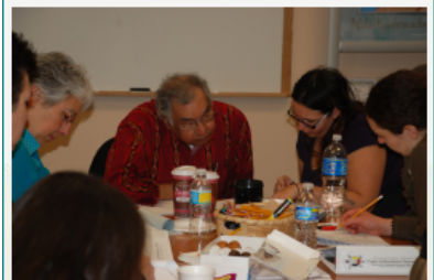
Potawatomi Language Acquisition with Fluent Speakers